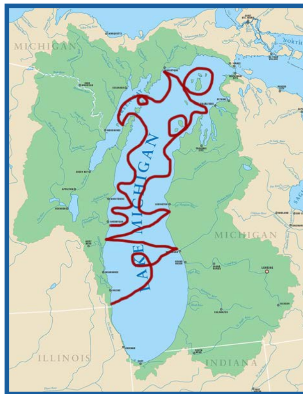
Above: After extensive research utilizing 5 years of current and wind data from the Great Lakes Environmental Research Laboratory, the above possible scenario of the E's path was calculated.

On June 19th, E was carefully placed on the south lawn of the club so members can pay tribute. Now is the time to take those pictures of your friends and family members with this legacy of our club's past as a sailboat racing community with a full compass rose course set each season. Don't forget to submit some creative pictures enjoying your time with the wayward east mark.