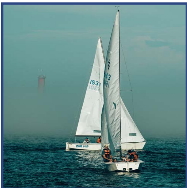
Above: Teams prepare for the start of the race on a foggy June 8th evening