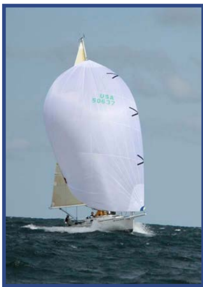
Left: Runaway in the middle of Lake Michigan

The HOOK Race is a 189 nautical mile race on Lake Michigan held each year in July. This year it will be held on July 24th. The challenging event starts outside the harbor in Racine, Wisconsin, "hooking" through Death's Door, a narrow and often treacherous passageway between Washington Island and Wisconsin's Door County Peninsula, continuing across Green Bay, and ending in Menominee, Michigan. Originally run the same day as the Chicago Mac race, in 2021 the 38th consecutive HOOK will be held the weekend after the Mac, on July 24, 2021. In the following years, the HOOK will alternate to the week before the Mac (in 2022, July 16, 2022) and the week after the Mac.