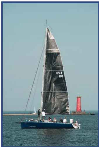
Above: Peerless being prepared for the first club race on June 9th.

"The Queen's Cup® Trophy is one of the oldest cups in world yachting still offered for competition every year. Its history dates back to an age when both British