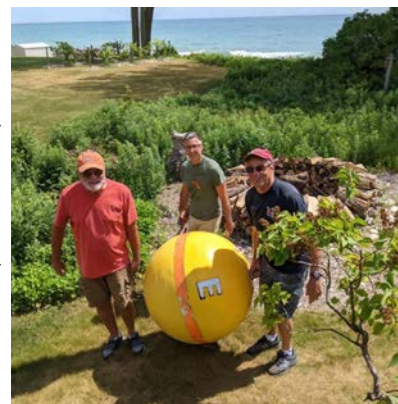
Carrying the freed E back to their awaiting truck, ready for the much anticipated drive home.