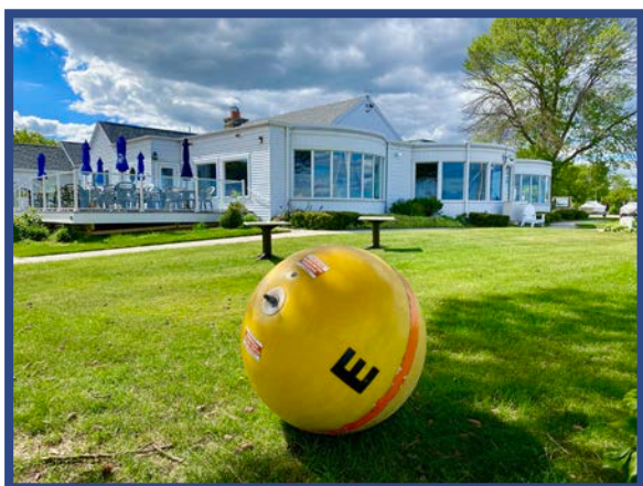
Above: E rests on the lawn of its true home. Its sanctuary and final resting place.